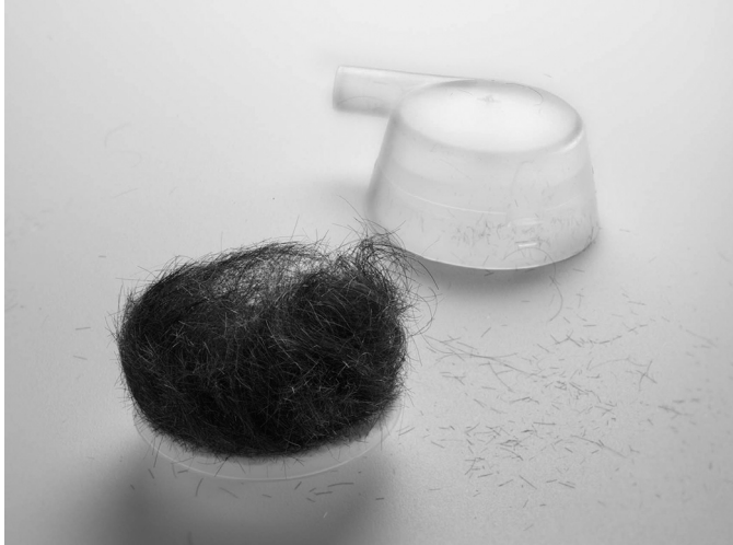
Fig 3. Picture of opened collection filter cassette, demonstrating large volume of clipped hair captured during clipping process using surgical clippers fitted with vacuum-assisted hair collection device (SCVAD).

may pose a risk for contamination of the operative site. The investigation documented that postclipping cleanup of the patient's skin and surrounding adjacent surface areas can be eliminated by using a clipper with vacuum-assisted technology, sequestering clipped hair particles within a closed container, resulting in substantial time savings before perioperative skin antisepsis and draping. The investigation also demonstrated a mean increase in TEWL following hair clipping with SSC and cleanup of residual hair particles using surgical tape. An increase in TEWL suggests that following repeat applications of surgical tape to skin test sites, structural changes occurred that affected the moisture balance in the outermost portion of the stratum corneum. TEWL is by convention used as a marker for skin barrier function that in the present study was altered during postclipping cleanup. The removal of residual hair with adhesive tape often required multiple passes to ensure complete removal of clipped hair from the surgical field before skin antisepsis. When the tape was sampled for microbial burden, a mean colony count of 3.9 Log 10 CFU and 4.6 Log 10 CFU was recovered from the chest and groin, respectively, suggesting that clipped hair can be a significant source of bacterial contamination within the surgical field.